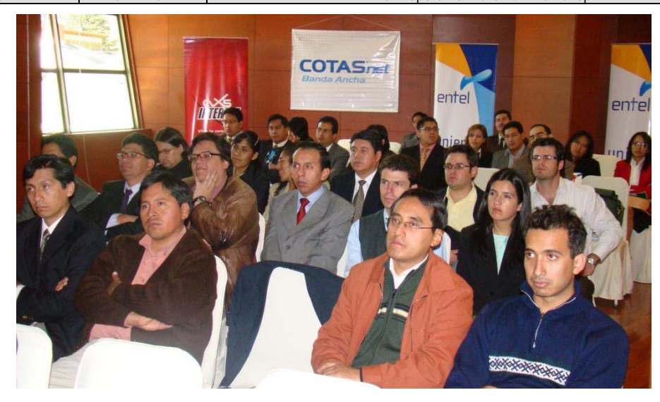
Figure 3-4: Attendees of the La Paz Workshop (1)