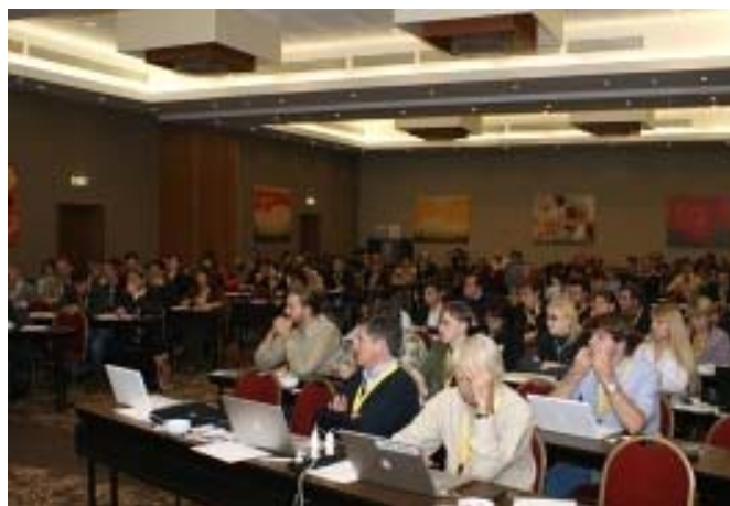
Figure 3-1: Attendees of the workshop